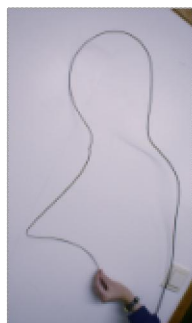
Stichopathes spp - whip coral.