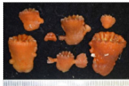
Endopachys greyi - solitary coral, often with polyps budding from the side - free-living, small (<3cm diameter)