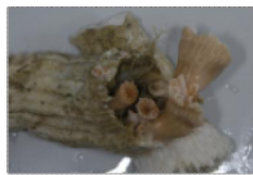
Desmophyllum dianthus - solitary coral, attached to hard substrata - up to 8cm diameter