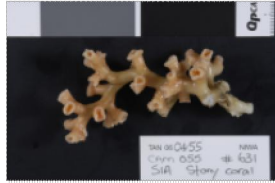
Solenosmilia variabilis - branching coral - forms large anastomosing colonies