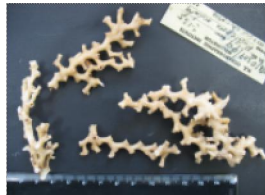
Madrepora oculata - branching, colonial coral - distinguished by alternating polyps on branches